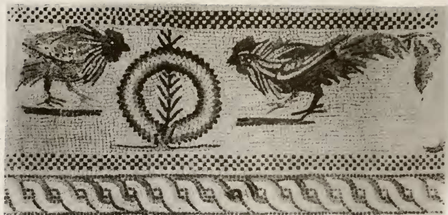
Fig. 1. Fighting cocks. Roman mosaic from Oescus, North Bulgaria (3rd century A. D.) (after И в а н о в, 1957)

appearance towards the beginnings of the 1st century A. D., while P e t t e r (1973) believes that the Domestic Fowl spread in Asia Minor and the Mediterranean about 750 B. C. He also notes the cause of the transformation of the cock into a sacred bird — because of the high egg-laying capacity of hens, cock were declared sacred, and were sacrificed at altars of the fertility deity. An interesting relief with a figure of a cock combined with the sculpture of a phalos, from the island of Delos, was dated from the 3rd century B. C. (Т а х о - Г о д и, 1989) (fig. 2). Н и к и т и н (1948) believes that Greece was the first main centre of the spread of the Domestic Fowl in Europe, which had been introduced from Persia in 330 B.C. У м а н с к а я (1972) points out that domesticated fowl has been known in Middle Europe since 8th century B.C., while in Western Europe it has appeared in 10th — 6th century B.C.